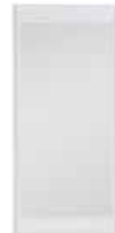
Full Head & Sill